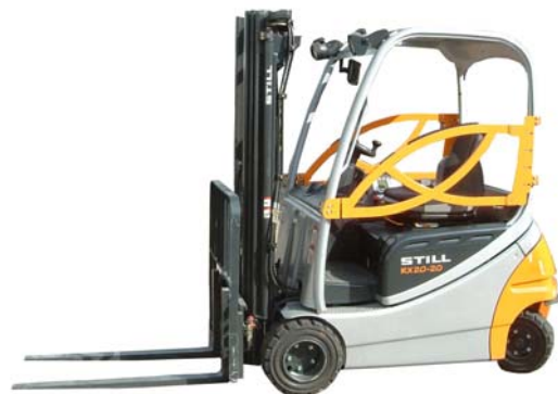
... and the brand new ...