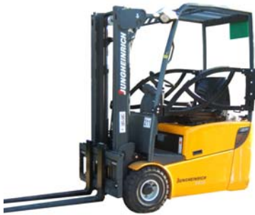
... for the small ones ...