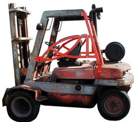
... for the pretty old ...