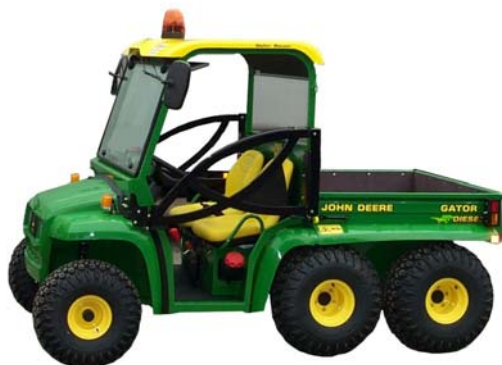
... and of course for the very special.