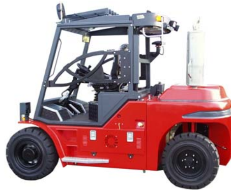
... and the extra large ...